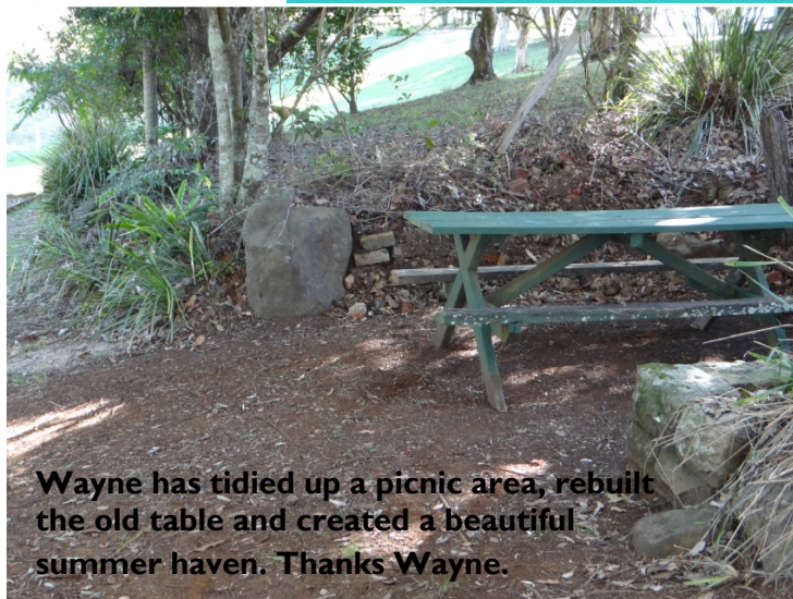
Wayne has tidied up a picnic area, rebuilt the old table and created a beautiful summer haven. Thanks Wayne.