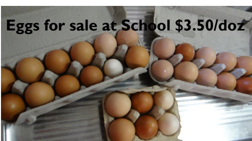
Eggs for sale at School $3.50/doz

Installation of new gardens by Wayne our super GA has been completed and he is busy filling them with soil. Soon we will have vegies as well as our own eggs at school.